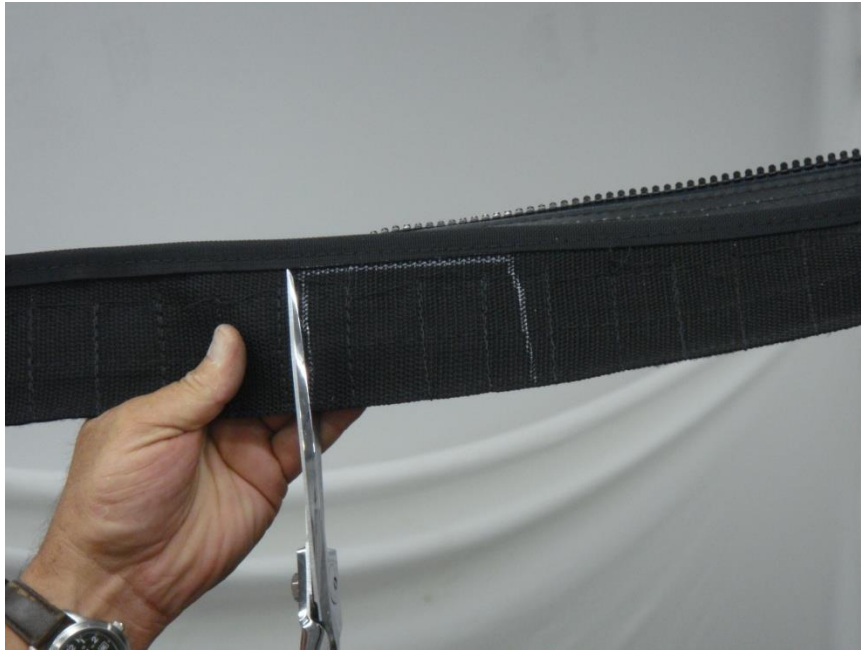
Figure 7.3 – Cut a 2” section out around where your clamps will be positioned on the Velcro Tab – be careful not to cut the binding