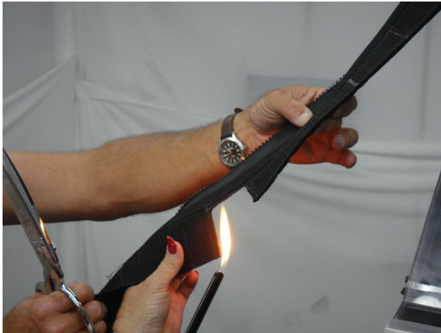
Figure 7.4 – Carefully burn the frayed thread around the cut area with a lighter.