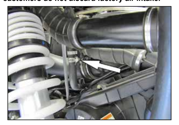
7. Loosen the clamp securing the vent hose to the intake tube.