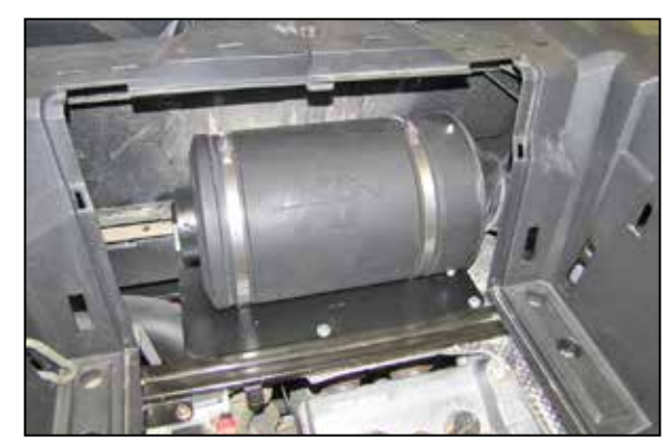
17. Install the filter canister assembly onto the mounting tray and connect the fresh air inlet hose. Adjust the canister and hose for best fit and then secure the canister and hose with the hose clamps. NOTE: Due to differences in the production factory foil heat shield, the heat shield may need to be reformed to allow the canister and fresh air hose to fit together.