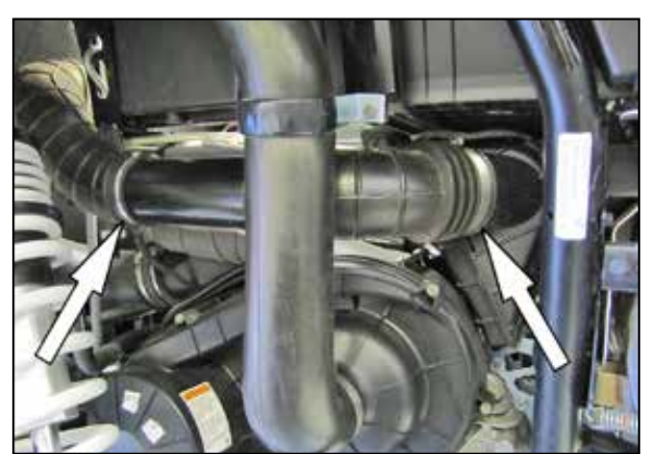
8. Loosen the hose clamp at the plenum and remove the bolt securing the intake tube. Then remove the intake tube from the vehicle.