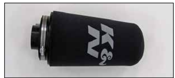
14a. Install the provided foam wrap onto the K&N ^{\!\otimes} air filter.