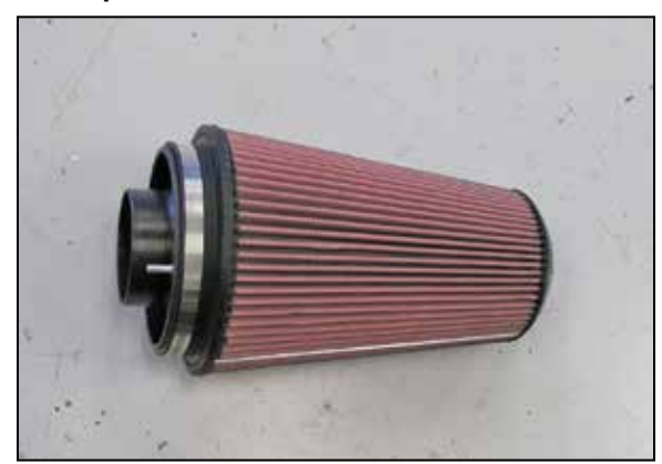
14. Install the adapter assembly into the K&N<sup>®</sup> air filter and secure with the provided hose clamp.

NOTE: Be sure to add a drop of the provided thread locker to each stud before installing into the adapter.