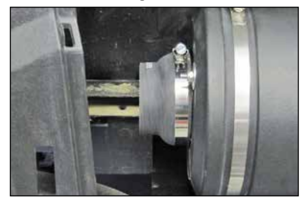
18. Install the provided coupler hose (084093) onto the filter adapter and secure with the provided hose clamp.