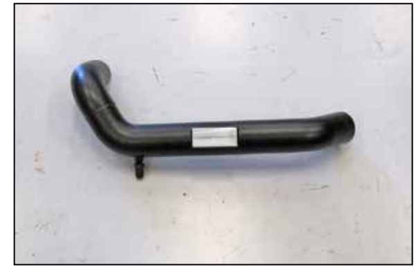
21. Install the provided vent fitting into the K\&N^{\circledast} intake tube.

NOTE: NPT fitting has tapered threads and only designed to be installed until hand tight, then tighten one rotation or when the fitting becomes difficult to return.