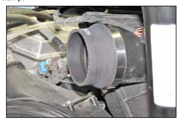
19. Install the provided coupler hose (084034) onto the factory intake plenum and secure with the provided hose clamp.