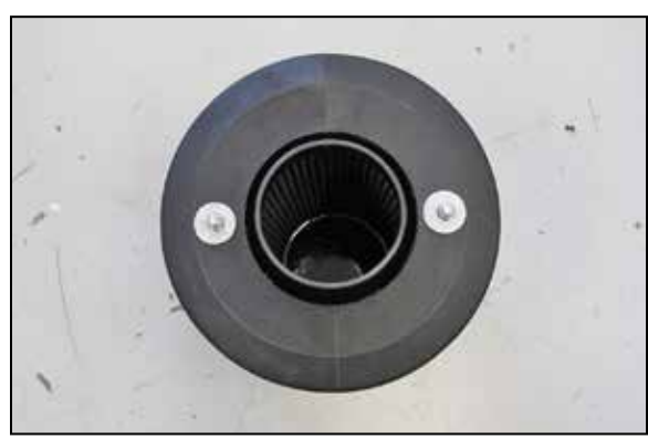
15. Install the filter assembly into the K&N® filter canister and secure with the provided hardware.