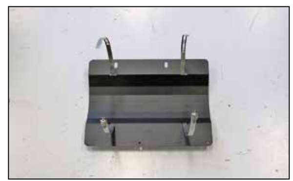
10. Install the two provided large hose clamps through the filter base plate as shown.