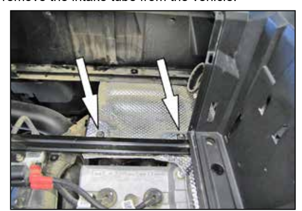
9. Remove the two nuts and bolts shown that secure the heat shielding to the chassis.