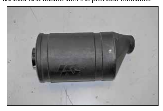
16. Install the end cap into the canister and secure with the provided hardware.