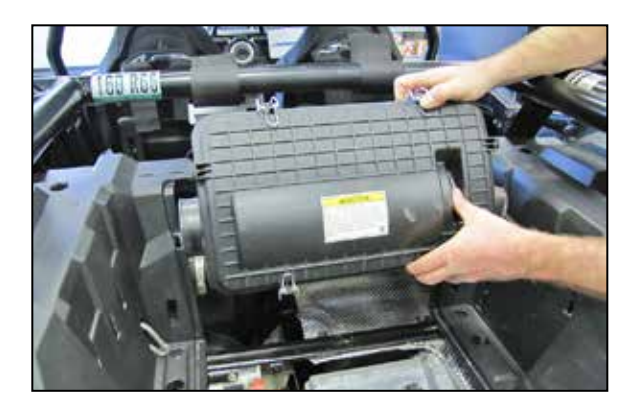
6. Remove the air filter housing from the vehicle. NOTE: K&N Engineering, Inc., recommends that customers do not discard factory air intake.