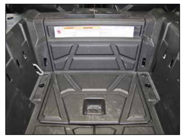
20. Reinstall the factory engine cover.