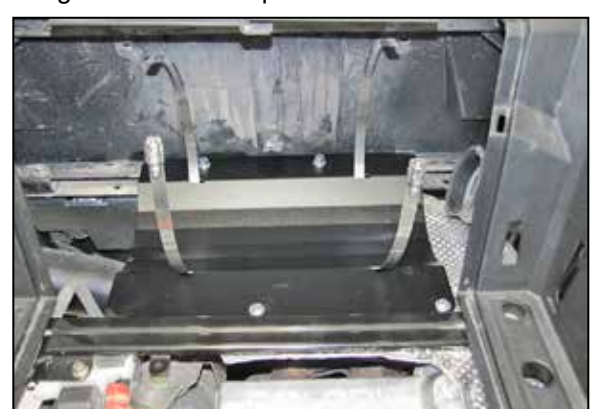
11. Install the filter base plate assembly as shown using the provided hardware.