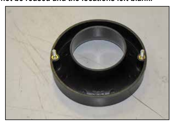
13. Install the two provided 6mm studs into the radius filter adapter as shown.

NOTE: the two upper air filter housing bolts will not be reused and the locations left blank.